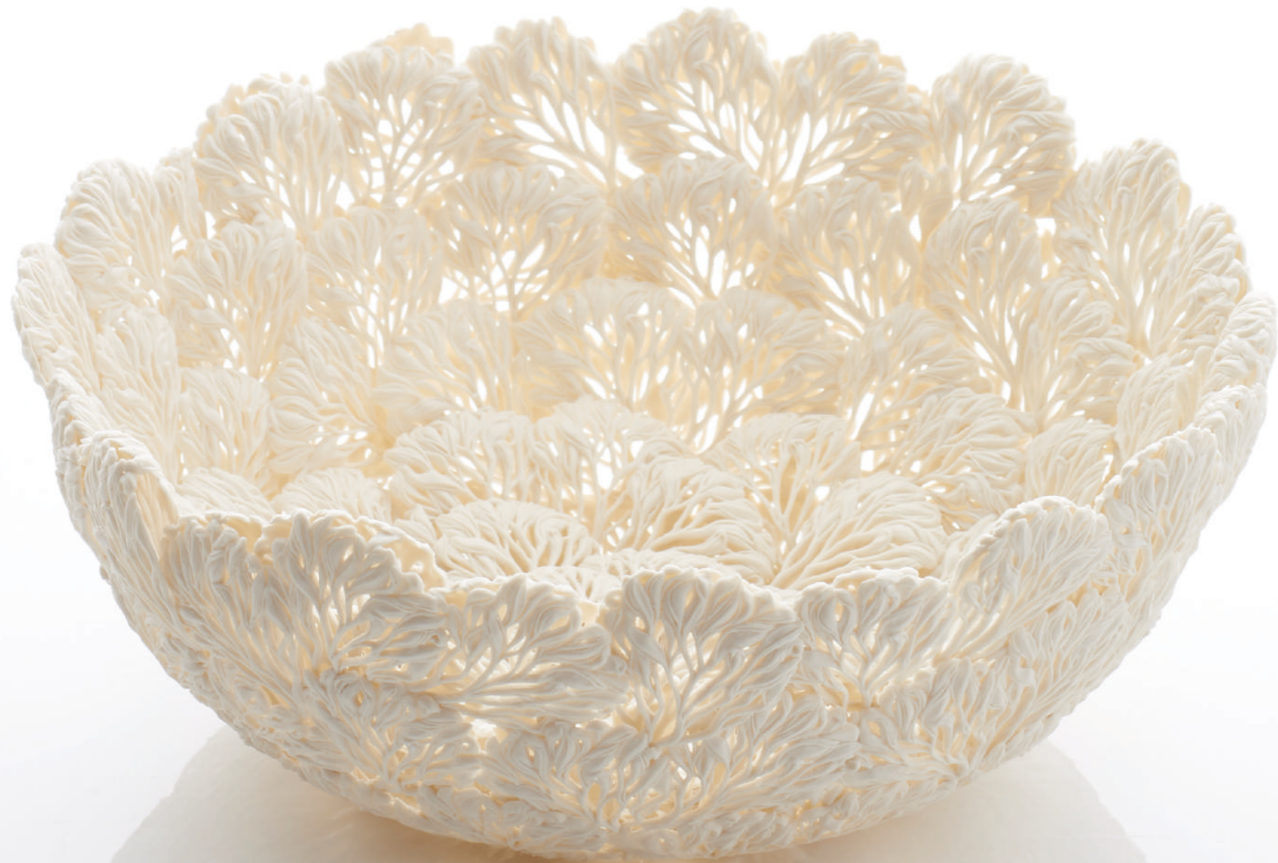
HITOMI HOSONO A Komorebi Bowl, 2017 Moulded, carved, pierced and hand-built porcelain Height 11.5cm (4 1/2") Diameter 29cm (11 3/8")