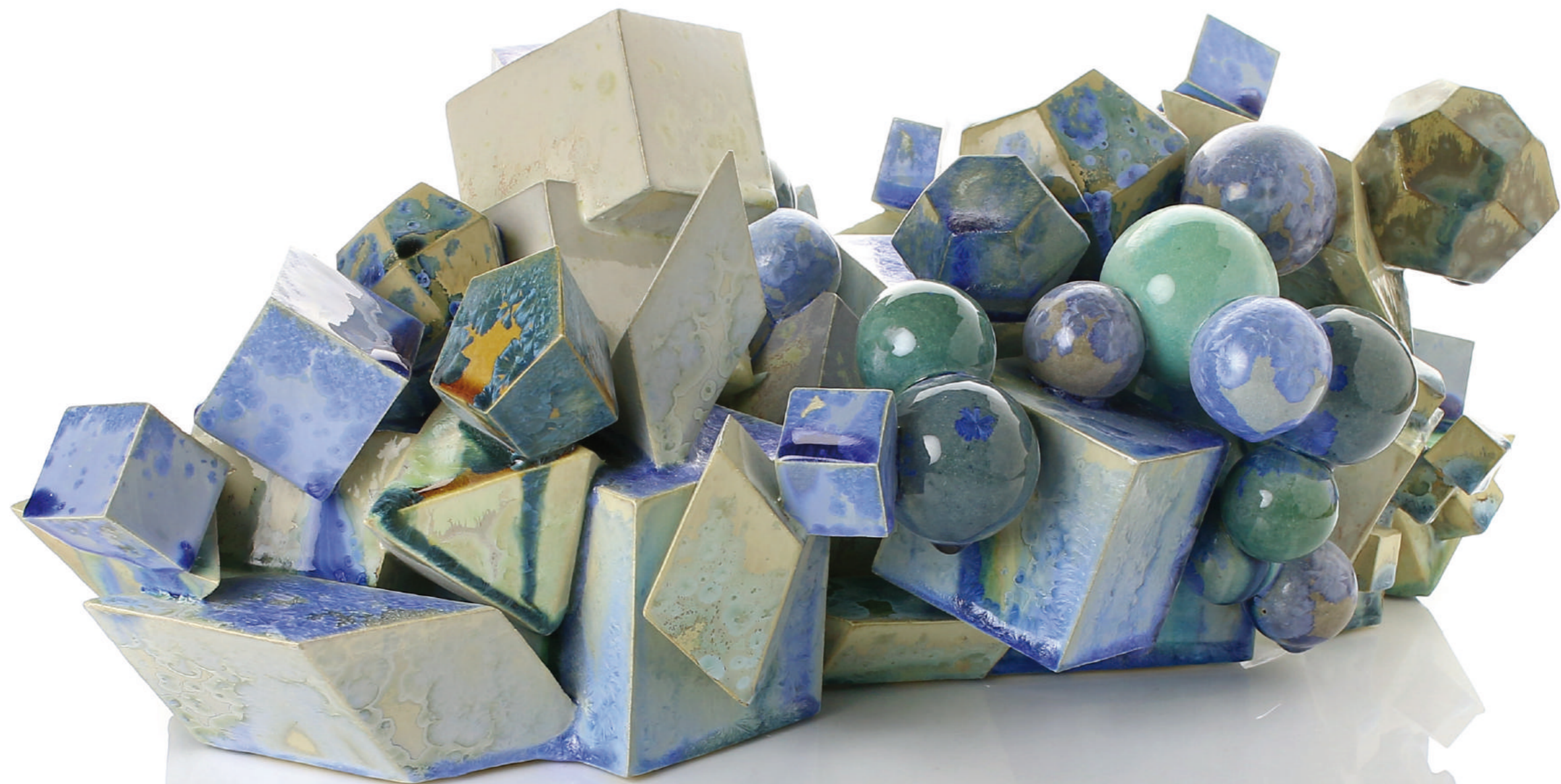
KATE MALONE Blue & White Magma Sculpture, 2017 Crystalline-glazed stoneware Height 18cm (7 1/8") Width 51cm (20 1/8") Depth 31cm (12 1/4")