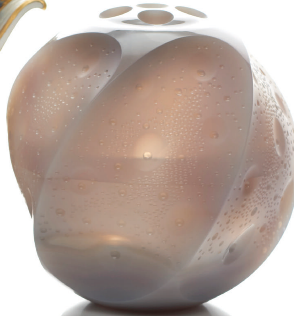
TOSHIYA OGUMA Creation of Life, 2007

Height 15cm (5 7/8") Width 21.5cm (8 1/2") Depth 16cm (6 1/4")