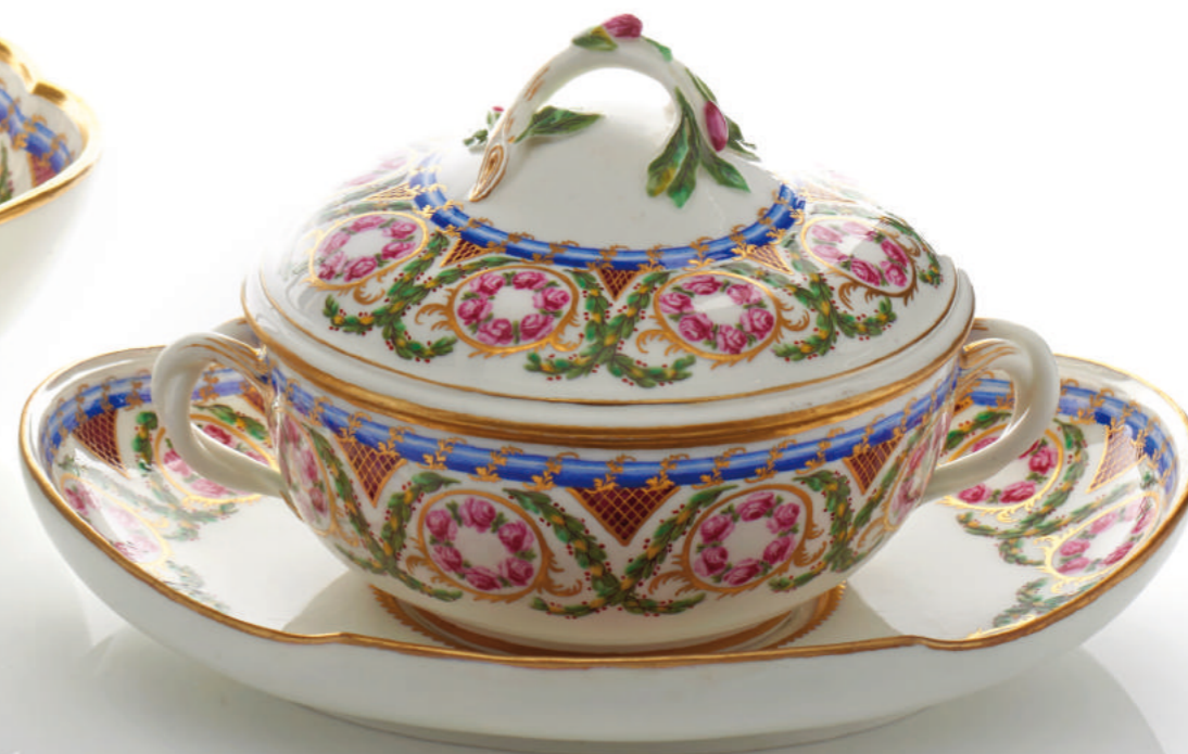
A Soft-Paste Sèvres Porcelain Ecuelle, Cover and Stand 1770 Height 11.2cm (4 3 / 8 "") Diameter 22.3cm (8 3 / 4 "")