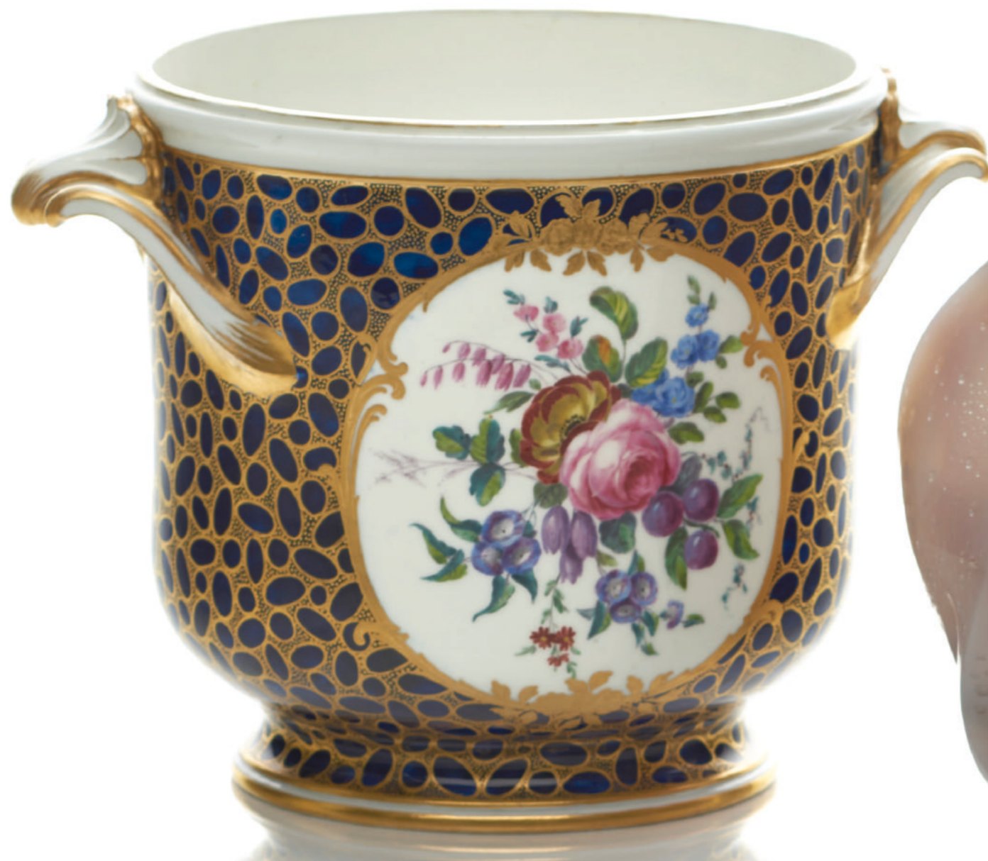
One of a pair of Soft-Paste Sèvres Porcelain Decanter Coolers given by Louis XV of France to Christian VII of Denmark, 1767

Height 15cm (5 7/8") Width 21.5cm (8 1/2") Depth 16cm (6 1/4")