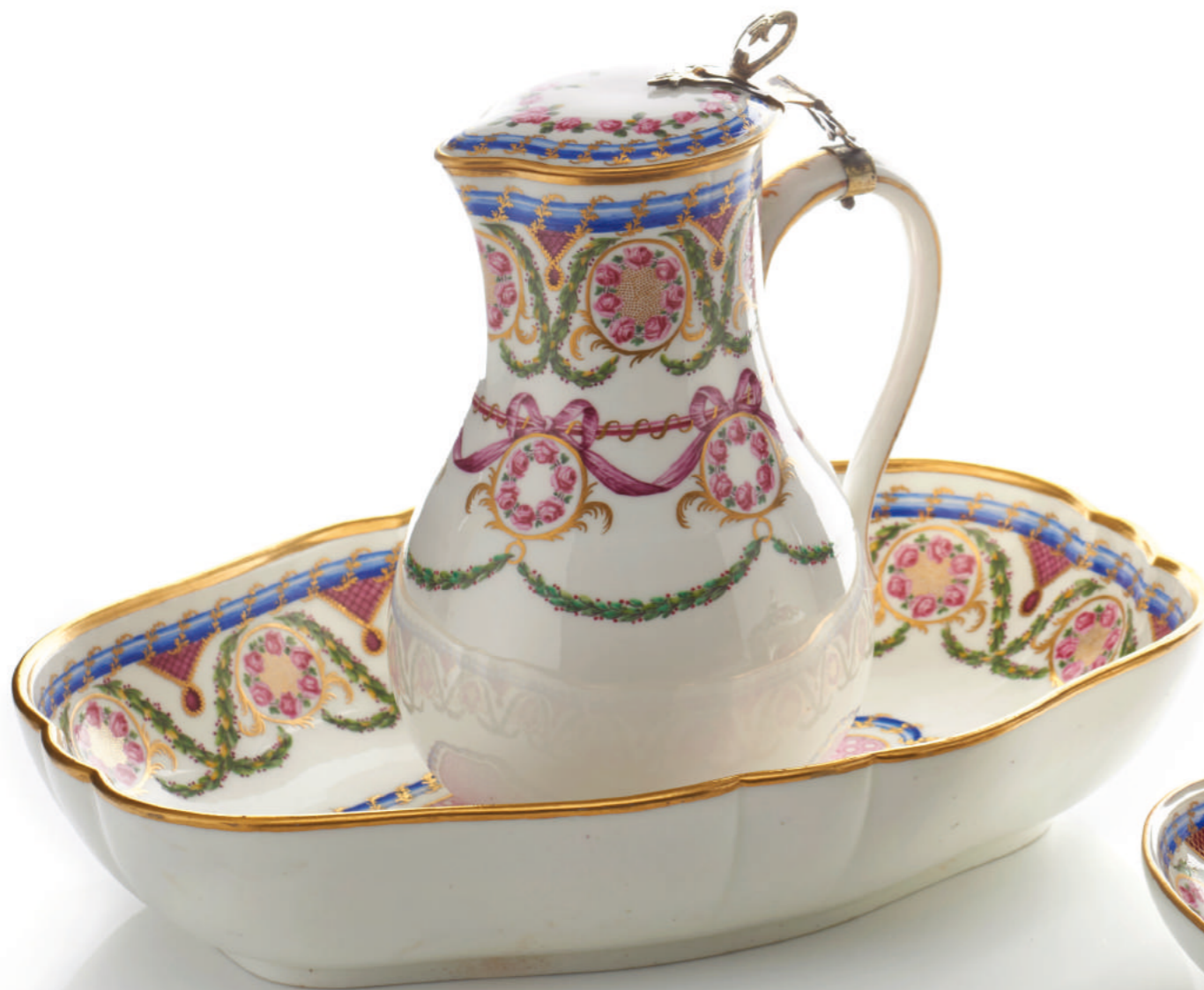
A Soft-Paste Sèvres Porcelain Ewer and Basin with silver-gilt mount 1770 Height 20cm (7 7 / 8 "") Width 29cm (11 3 / 8 "")