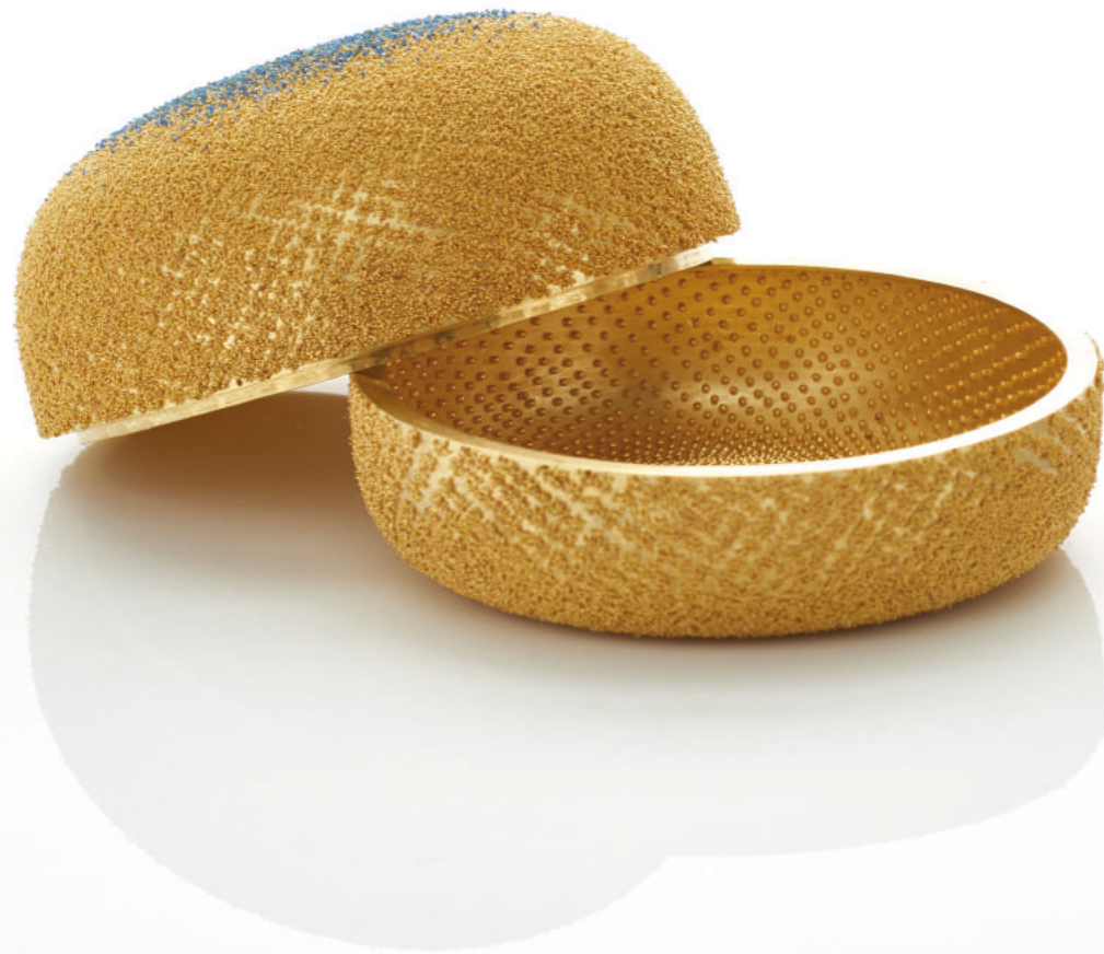
GIOVANNI CORVAJA Box , 2013 Enamel Made by the artist in Italy Height 6cm (2 3/8") Diameter 9cm (3 1/2")