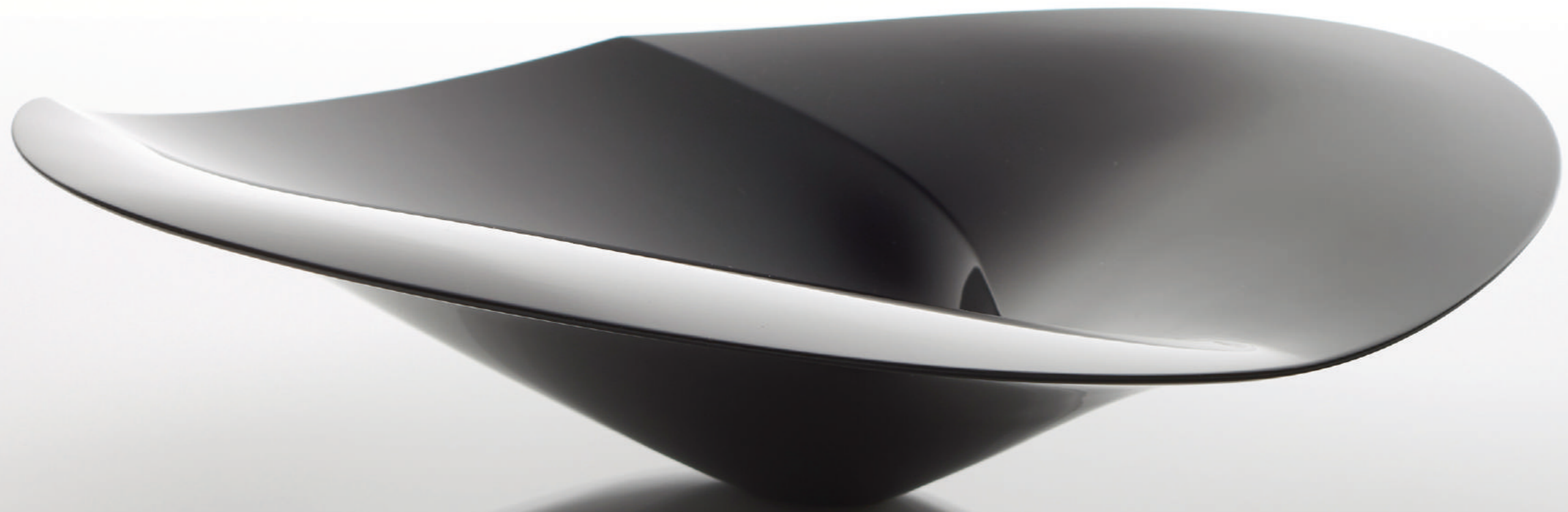
TAKESHI IGAWA Line and Surface XVI , 2016 Black lacquer Made by the artist in Japan Height 9.5cm (3 3/4") Diameter 36cm (14 1/8")