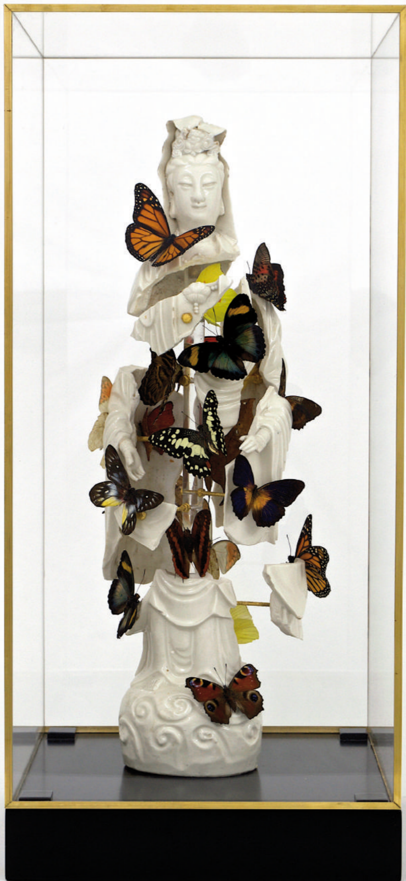
BOUKE DE VRIES Guan Yin with Butterflies, 2017 19th century Chinese blanc de chine porcelain with butterflies Height 59.5cm (23 3 / 8 "") Width 26.5cm (10 3 / 8 "") Depth 26.5cm (10 3 / 8 "")