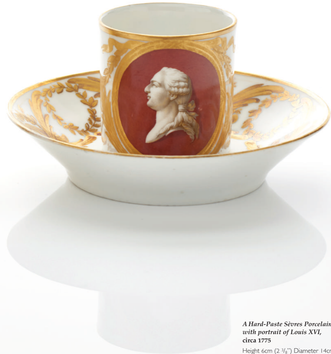
A Hard-Paste Sèvres Porcelain Cup & Saucer with portrait of Louis XVI, circa 1775 Height 6cm (2 3/8") Diameter 14cm (5 1/2")