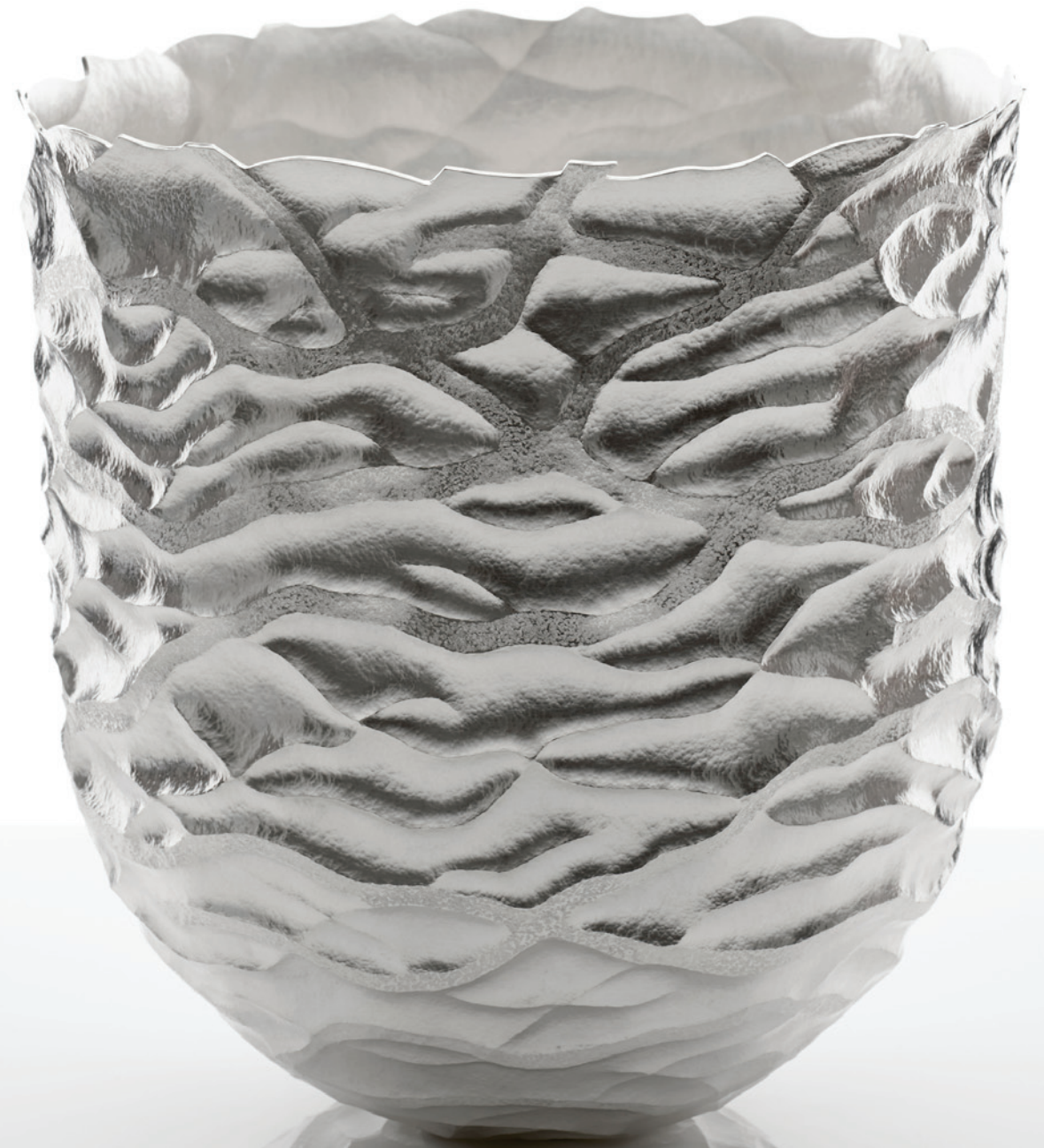
Hiroshi Suzuki Seni Vase , 2014 Hammer-raised and chased Fine silver 999 Height 29.5cm (11 5/8") Diameter 29cm (11 3/8") (HS768)