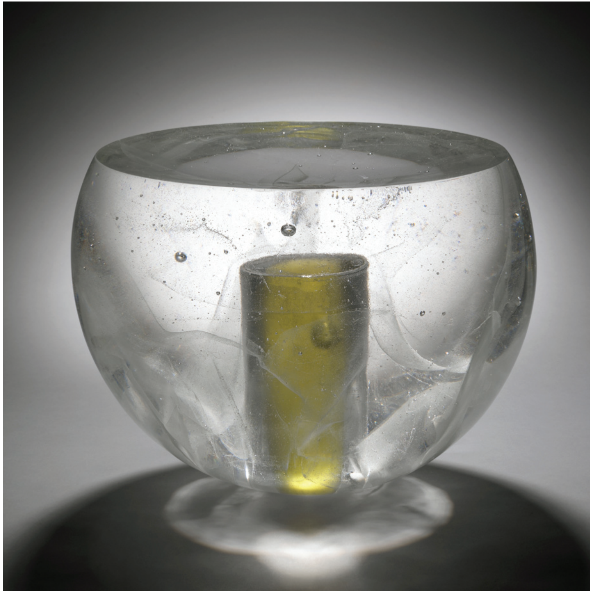
Bruno Romanelli Hamal , 2014 Kiln-cast and polished clear glass with tea green insert Height 21.5cm (8 1/2") Diameter 29cm (11 3/8") (BRo334)