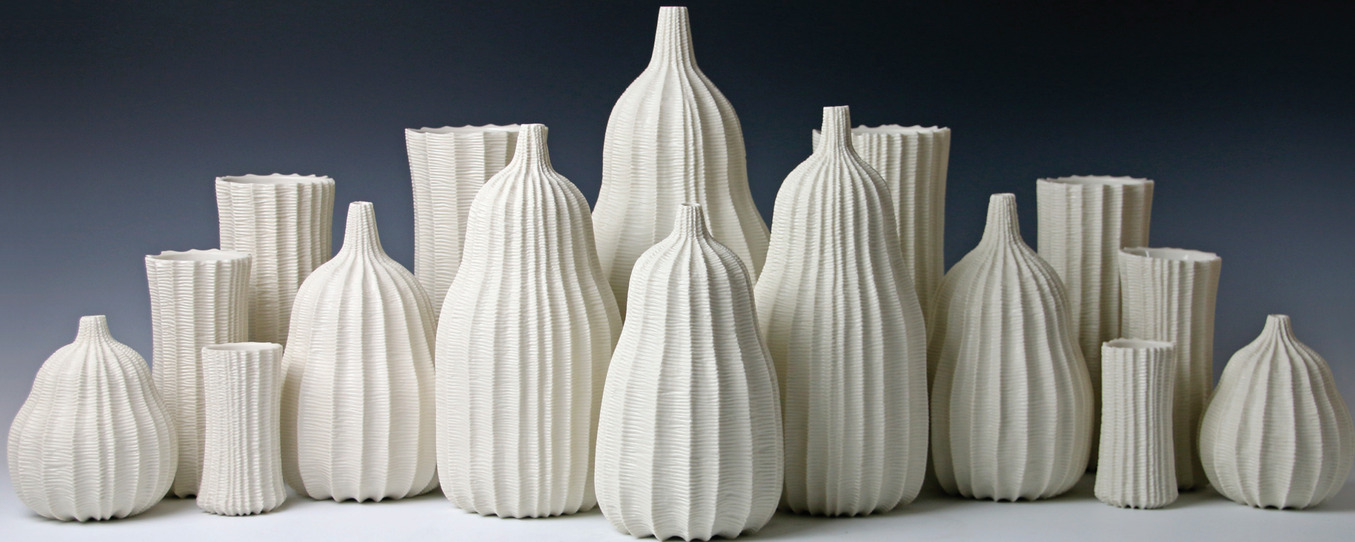
Andrew Wicks Garniture of Sixteen Vases , 2014 Thrown and carved porcelain Height 34cm (13 3 / 8 "") Width 90cm (35 3 / 8 "") Depth 35cm (13 3 / 4 "") (AW151)