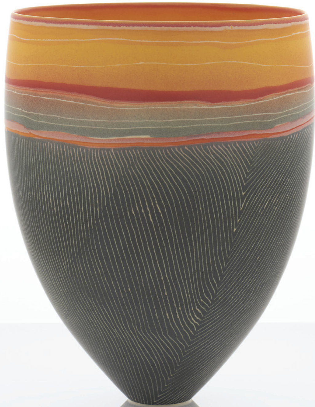
Pippin Drysdale Tanami Mapping III - Smoke Hills , 2014 Porcelain Height 34cm (13 3/8") Diameter 25cm (9 7/8") (PD95)