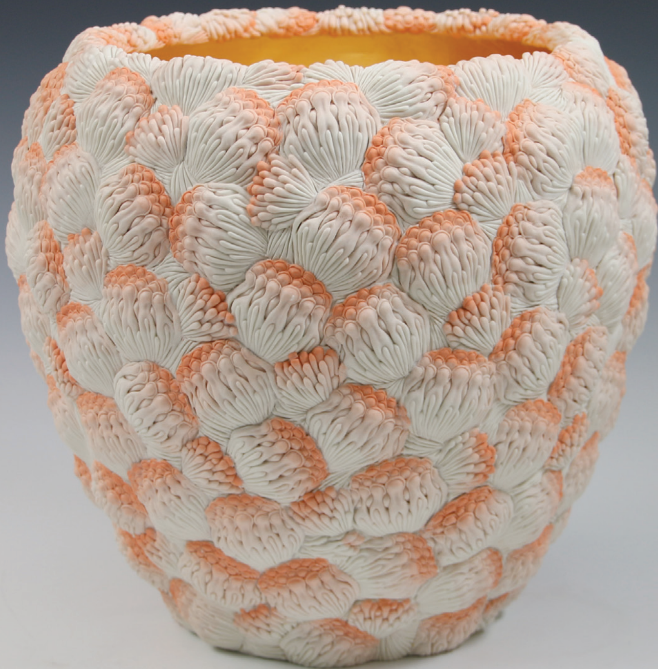
Left: Hitomi Hosono A Tall Orange Coral Bowl, 2014 Moulded, carved and hand-built coloured porcelain with red gold leaf interior Height 28cm (11") Diameter 31cm (12 1/4") (HH193)