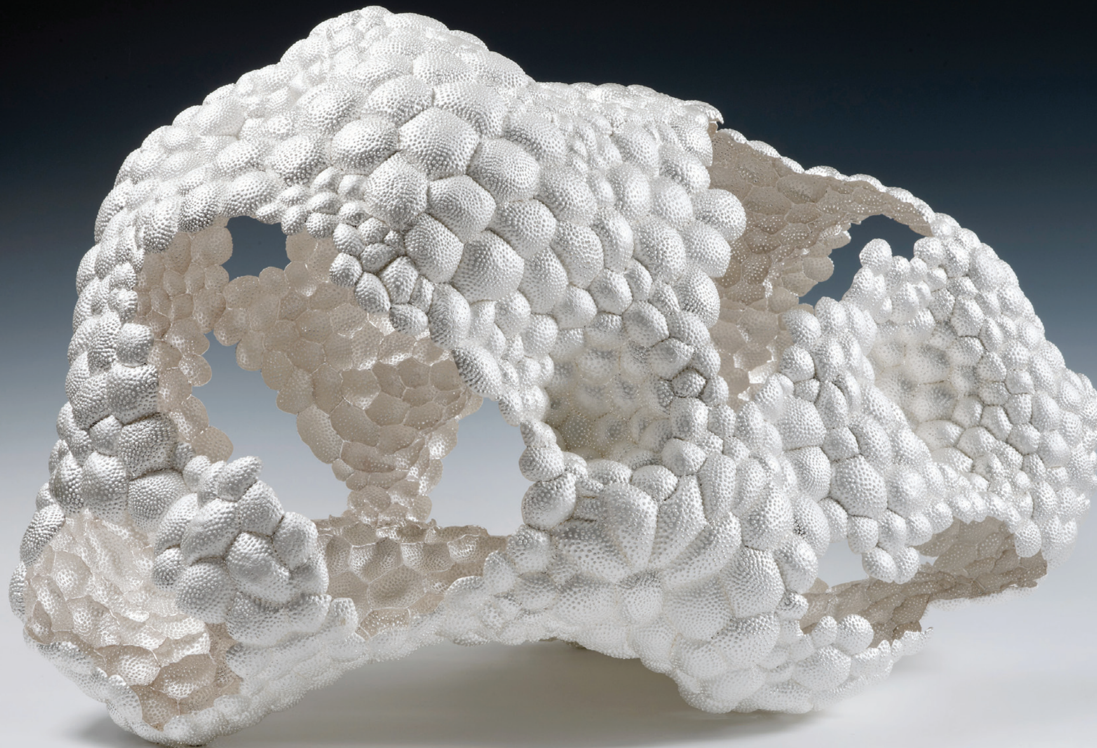
Junko Mori Uncontrollable Beauty; Lichen Cloud , 2012 Forged Fine silver 999, 141b 7oz (6550g) Height 48cm (30 3/8") Width 78cm (30 3/4") Depth 40cm (15 3/4") (JM428)