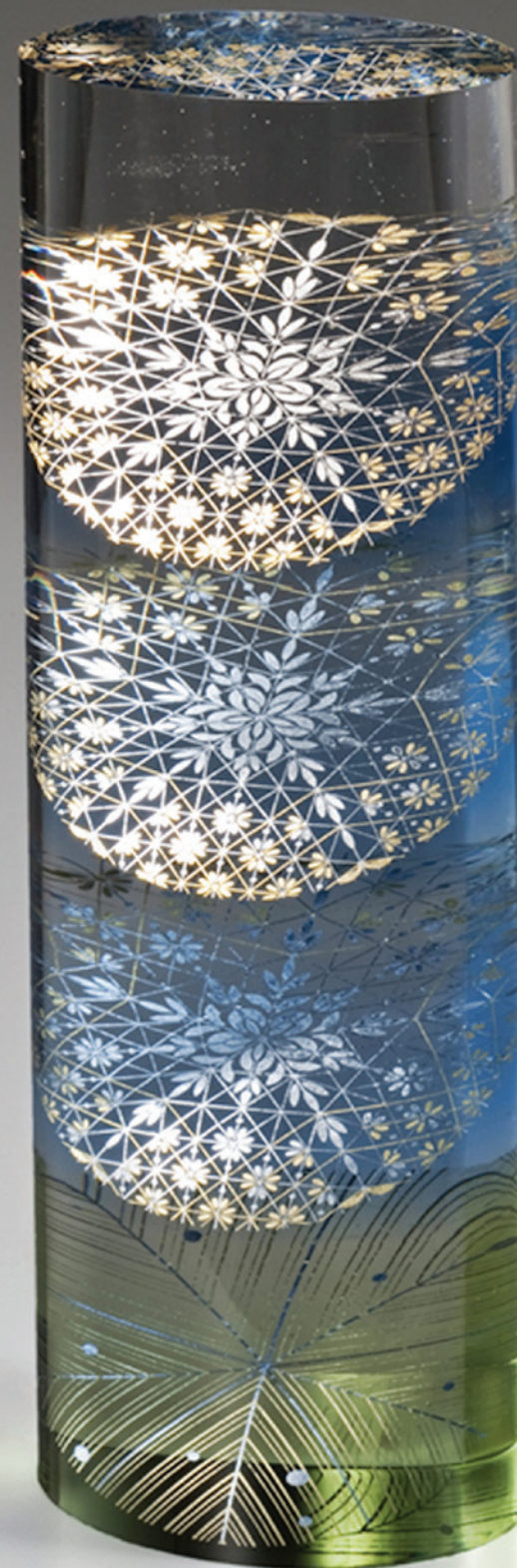
Right: Akane Yamamoto Asagao, 2011 Cast glass with Kirikane, a traditional Japanese technique of gold leaf decoration Height 27cm (10 5/8") Width 9cm (3 1/2") Depth 6.5cm (2 1/2") (AY03)