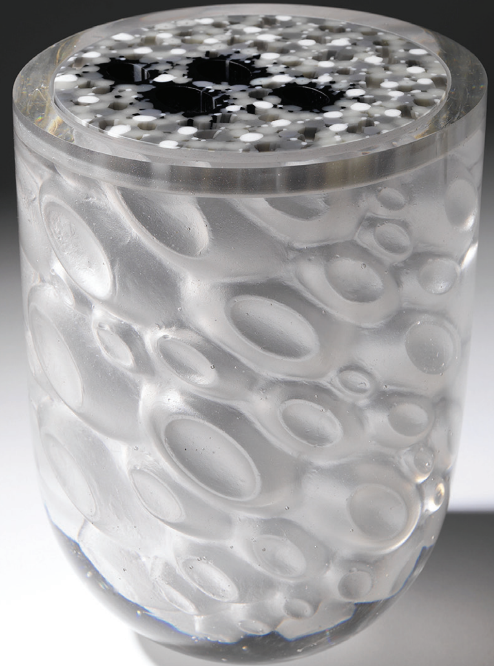
Angela Jarman Vascularium II , 2014 Lost-wax cast lead crystal and murini insert Height 19.5cm (7 5/8") Diameter 15cm (5 7/8") (AJ68)